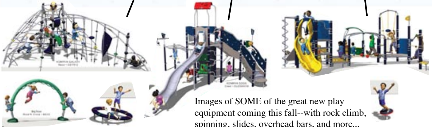
Images of SOME of the great new play equipment coming this fall--with rock climb, spinning, slides, overhead bars, and more...